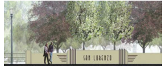
San Lorenzo Gateway