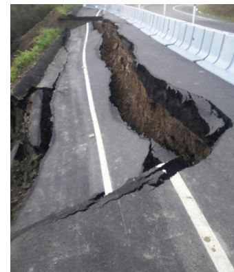
A section of Redwood Road near Castro Valley collapsed during heavy rains last year. Repairs will continue through February